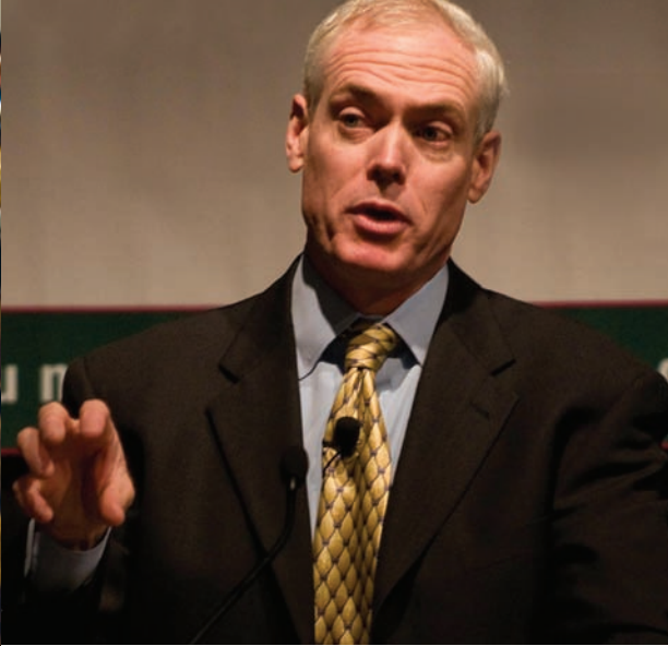
Jim Collins inspires nonprofits at Community First Foundation's event called Good to Great and the Social Sectors