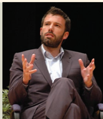
Actor Ben Affleck joined other well-known individuals at the International Relations Roundtable. Topics included "Enhancing America's Reputation in the World" and "Global Poverty."