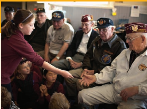
World War II veterans receive a special gift from visiting with school children in Colorado.