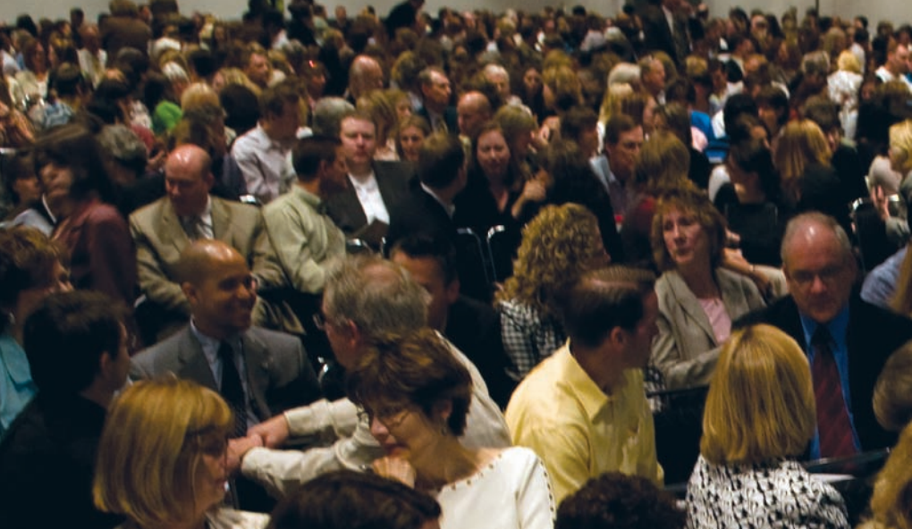
The audience engages in small group discussions to decide the single most important question they'd like to ask Collins