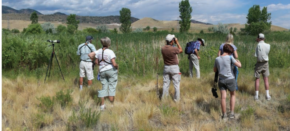
The Audubon Society's Walk the Wetlands group finds footage for their video project

CPC, which advocates for an open democracy and promotes social issues, is among six Denver-area nonprofits that learned to create videos and public service announcements as well as use emerging Web, social networking and alternative media to their advantage. Community First Foundation partnered with Deproduction, a nonprofit leader in new media, to provide the training and support to the six nonprofits.