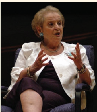
Madeleine Albright, Former U.S. Secretary of State, participates in the International Relations Roundtable.

Community First Foundation donated $15,000 as one of eight partner sponsors of the Roundtable. The Foundation considered its support a natural extension of its community involvement and was particularly pleased that 3,000 high school students attended the discussions.